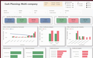
Cash Planning Multi Company

Create interactive reports and dashboards with real-time insights, supported by Excel and Power BI integration.