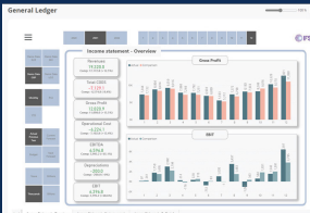
General Ledger Dashboard

Use real-time reporting and predictive analytics to guide business performance.